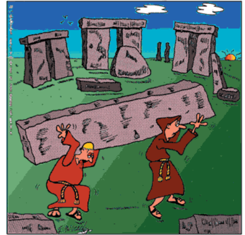
"I hate changing to Daylight Saving Time."